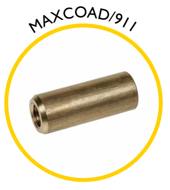
Sonde adaptor M12 to M10 female