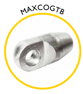
Guide tip for Maxi Cobra HC