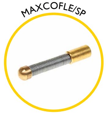
Flexi end spring for 14mm rod