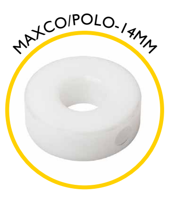
Rod guiding eye