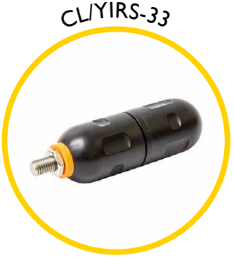
Sonde 33kHz 38mm (requires MAXCOAD/911 to fit)