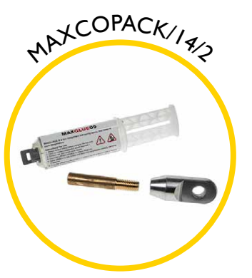
Replacement end fitting repair kit