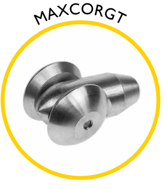
Roller guide tip