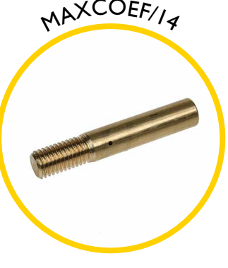
End fitting for 14mm rod