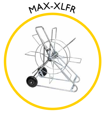
Maxi Cobra HC replacement frame and reel