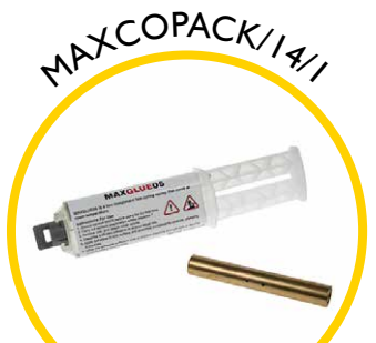
Splice repair kit for repairing broken rod