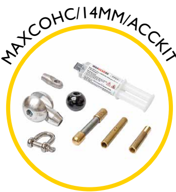
Accessory kit including various fittings for additional functionality